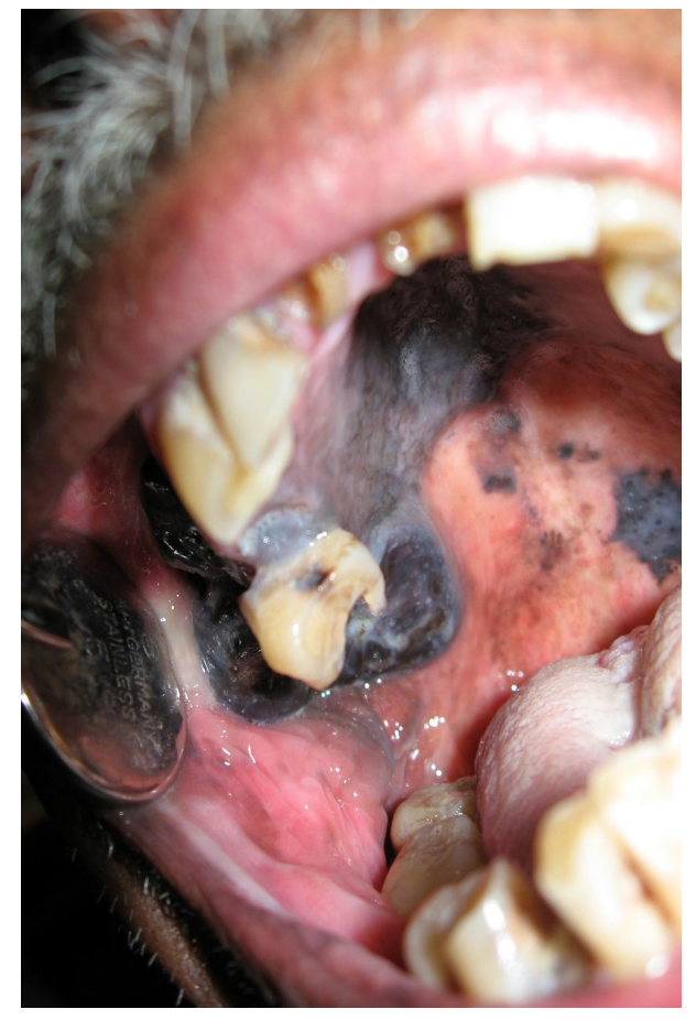
Fig. 3: Intra-oral view showing blackish macular area involving anterior and posterior palatal area

The histopathology was suggestive of malignant melanoma. The patient was further referred to surgical oncology department where he is treated with surgical resection and radiotherapy.