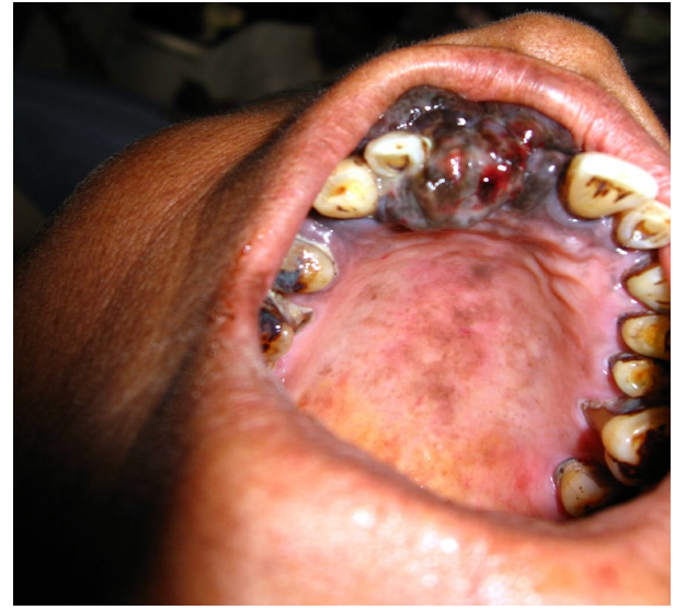
Fig. 2: Intra-oral view showing fullness of lip noted in maxillary anterior region.