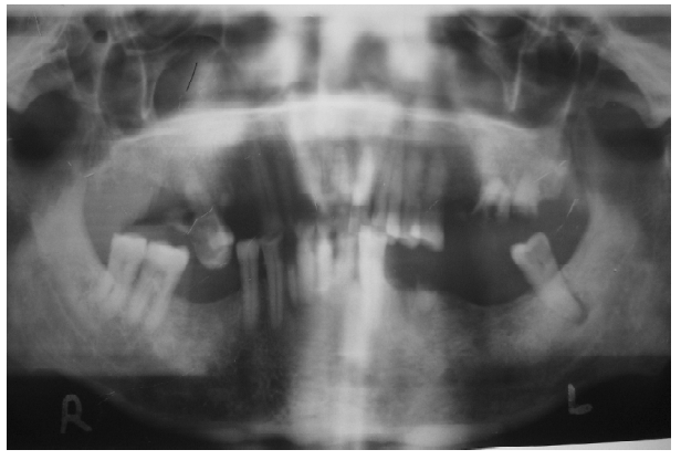
Fig. 4: Panoramic radiograph showing extensive bone destruction which extends from right maxillary 1st molar to right maxillary tuberosity area with tooth floating appearance of 1st molar

Malignant melanoma is a potentially aggressive tumor of melanocytic cell origin [1]. Oral melanomas are uncommon and thought to arise primarily from melanocytes in the basal layer of the squamous mucosa. The etiology of oral malignant melanoma essentially unclear till date however tobacco, chronic irritation from ill-fitting dentures, ingested and inhaled environmental carcinogens at high internal body temperature can be predisposing factors [12,5,13]. Malignant melanoma of oral cavity have a variety of genetic expression at molecular level. The of loss of heterozygosity at 12p13 and loss of p27KIP1 protein expression contribute to melanoma progression [14]. However melanoma-associated antigens are expressed during the transformation