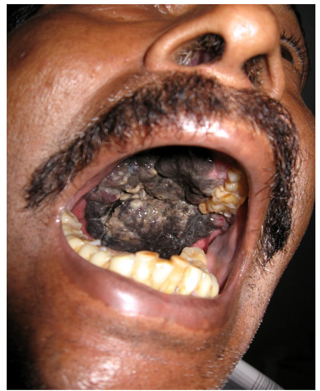
Fig. 2: Intra-oral view showing black color growth extending from anterior palate (maxillary central incisor region) to posterior palate involving the left maxillary alveolar ridge and tuberosity region