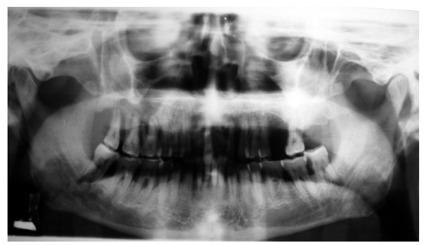
Fig. 3: Panoramic radiograph showing extensive bone destruction which extends from left maxillary 1st molar to 3<sup>rd</sup> molar involving same tuberosity area with tooth floating appearance of maxillary 1<sup>st</sup>, 2<sup>nd</sup> and 3<sup>rd</sup> molar

malignant melanoma. The patient was further referred to surgical oncology department where he is treated with surgical resection and radiotherapy.