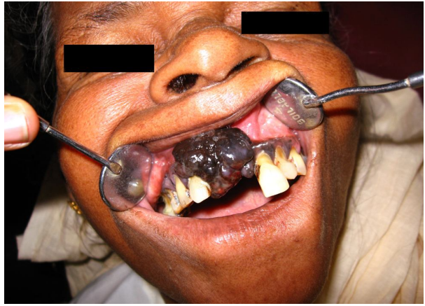
Fig. 1: Intra-oral view showing black sessile growth of 3x3 cm is noted in maxillary anterior region which was extending from right maxillary lateral incisor to left maxillary central incisor. The surface of the outgrowth was smooth and glistening with bossing. The growth had typical grayish black color of melanoma

noted in submaxillary nodes. On the basis of clinical presentation provisional diagnosis of oral malignant melanoma has been made. The patient was advised for maxillary occlusal radiograph to rule out any