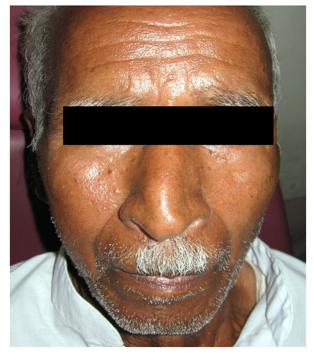
Fig. 1: Profile view of patient

from maxillary 1st molar to maxillary tuberosity region. The growth was extending buccally involving buccal sulcus and palate. There were a number of blackish macular area involving anterior and posterior palatal area noted (Fig.3). There was extensive sub-maxillary lymphadenopathy noted. On the basis of clinical presentation a provisional diagnosis of oral malignant melanoma has been made. The patient was advised for panoramic radiograph which showed extensive bone destruction which extends from right maxillary 1st molar to right maxillary tuberosity area with tooth floating appearance of 1st molar (Fig.4). The patient was advised for incisional biopsy.