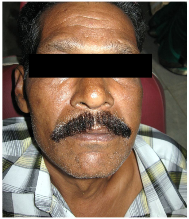
Fig. 1: Profile view of patient Indian Journal of Dental Education / Volume 9 Number 1 / January - March 2016

A 45 year old patient (Fig.1) complaint of black color mass in left side of upper jaw since 4 months. Previously it was a small black growth on palate which was progressively increasing in size. He was normally built and has normal gait and posture. Extra-orally no significant finding noted(Fig.1). Intraorally a black color growth extending from anterior palate (maxillary central incisor region) to posterior palate involving the left maxillary alveolar ridge and tuberosity region(Fig.2). The surface of growth was ulcerated and covered with yellowish necrotic slough. The left side maxillary molars were mobile and extensive sub-maxillary lymphadenopathy is noted. On the basis of clinical presentation provisional diagnosis of oral malignant melanoma has been made. The patient was advised for panoramic radiograph which showed extensive bone destruction which extends from left maxillary 1st molar to 3rd molar involving same tuberosity area with tooth floating appearance of maxillary 1st, 2nd and 3rd molar(Fig.3). The patient was advised for incisional biopsy. The histopathology was suggestive of