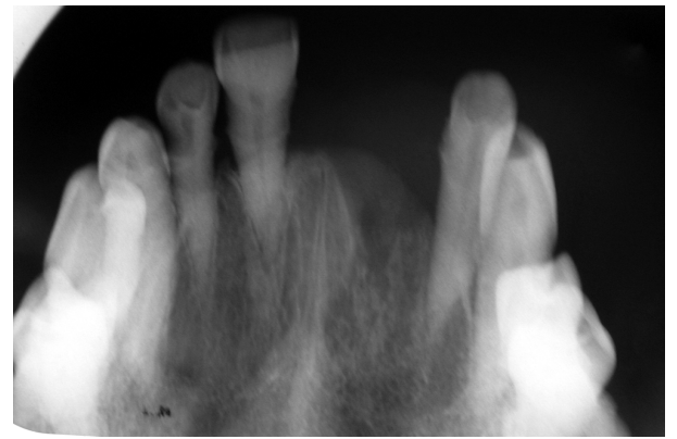
Fig. 3: Maxillary occlusal radiograph showing extensive bone resorption in maxillary anterior region

bony involvement. The maxillary occlusal radiograph(Fig.3) shows generalized bone loss. Patient was advised for incisional biopsy. The histopathology was suggestive of malignant melanoma.The patient was further referred to surgical oncology department where she is treated with surgical resection and radiotherapy.